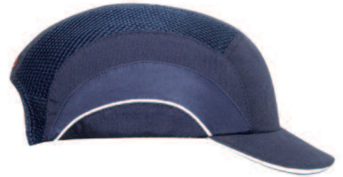
Short Peak (5cm) shown above